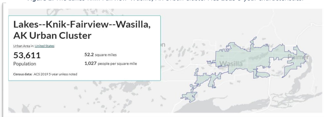
Figure 1: The Lakes-Knik-Fairview-Wasilla, AK Urban Cluster ACS 2019 5-year characteristics.

The Mat-Su MPA is expected to include the most urbanized areas within the borough, including the cities of Palmer and Wasilla and the Knik-Fairview area.