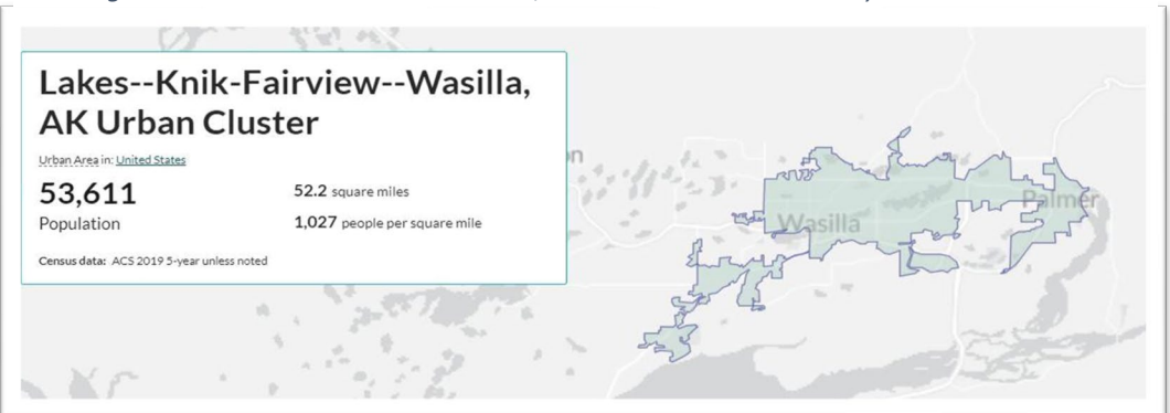
Figure 1: The Lakes-Knik-Fairview-Wasilla, AK Urban Cluster ACS 2019 5-year characteristics.

The Mat-Su MPA is expected to include the most urbanized areas within the borough, including the cities of Palmer and Wasilla and the Knik-Fairview area.